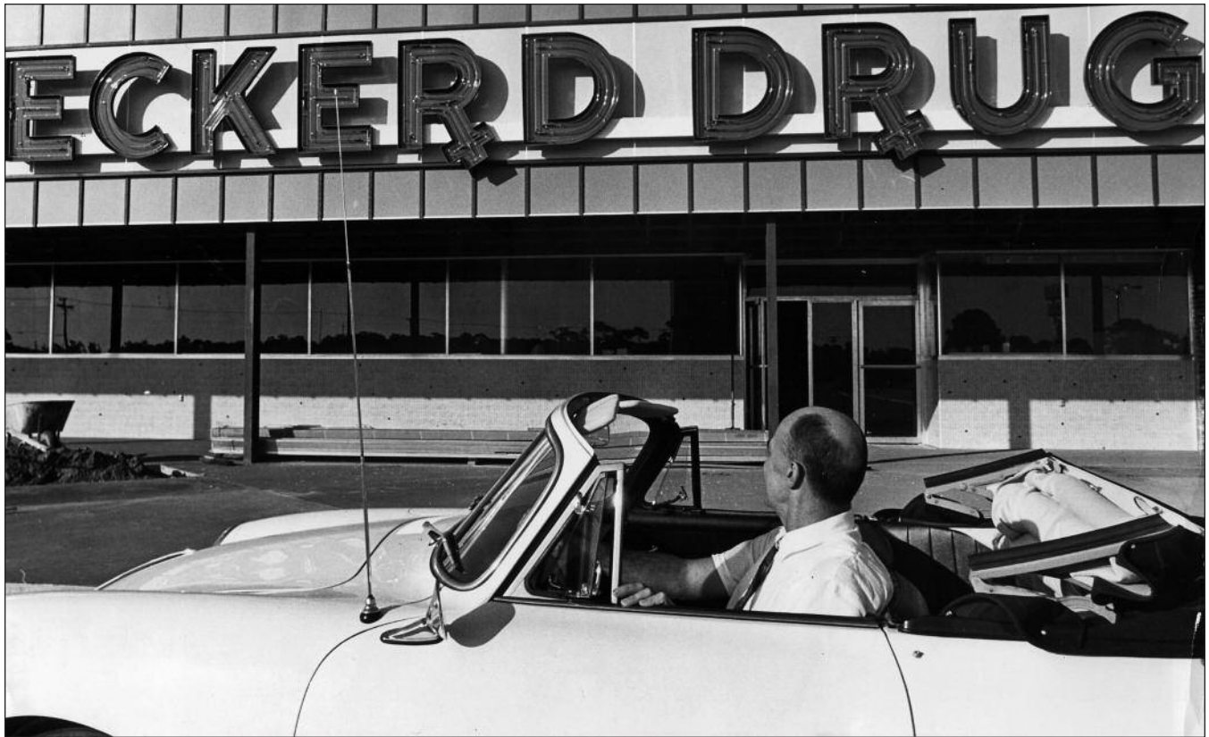
Times files (1965)

During the '60s, Eckerd hooked up with Publix supermarkets to build new strip malls all over Florida. His favorite conveyance, a sporty convertible, kept sun on his pate.